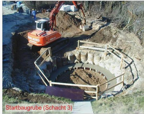
Startbaugrube (Schacht 3)