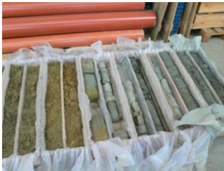
Cross section Danube undercut